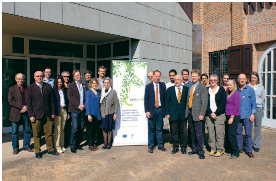
CAMBrella Midterm Meeting Bologna – Ca' la Ghironda, March 23 to 25, 2011